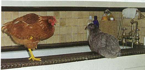
Some pets take more sitting than others

"We provide a collection and delivery service," she says, "and I won't put a Berkhamsted dog into a Berkhamsted home. They usually settle in very quickly."