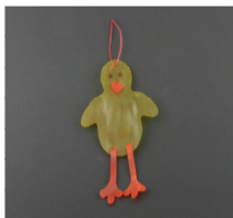
Edible Easter Chick £2.25