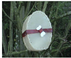
Edible Easter Egg £8.50