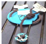
Rope toys £4.50