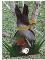
Edible Easter Bunny £4.50

Show your pet how much you care with our fun and inspirational Easter gifting from cat and dog toys to edible Easter bunnies! Postage and packaging is absolutely FREE . To order, log onto www.walk-the-dog.net