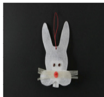
Edible Easter Bun £2.25