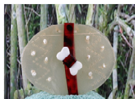
Edible Easter Egg Card £5.50