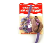
Mouse with cat nip pouch toy £2.50