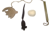
Cat toy £3.80